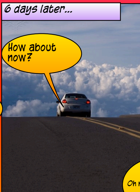
6 days later...