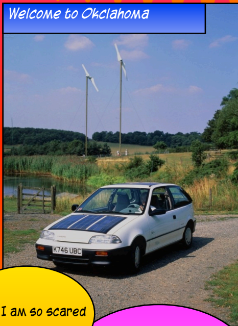
Welcome to Oklahoma